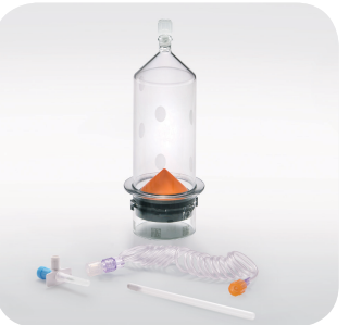
FLEXS-150-SPK Single syringe with 60" low pressure tubing with prime tube + 1 fill spike 50 per box