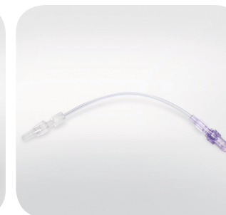
PRESSO MEDRAD® PRES Pressure-Rated Extension Set 50 per box