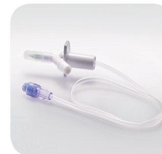
IBP TS MEDRAD® Imaging Bulk Package Transfer Set 50 per box