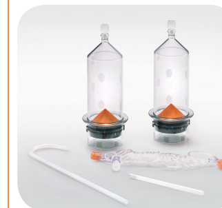
FLEXD-150-QFT Dual syringe kit with 60" low pressure T-tubing with prime tube + quick fill tube 20 per box