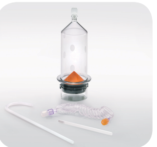
FLEXS-150-QFT Single syringe with 60" low pressure tubing with prime tube + quick fill tube 50 per box