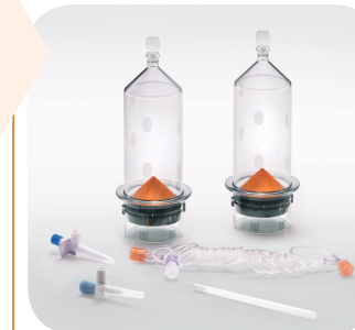
FLEXD-150-SCS Dual syringe kit with 60" low pressure T-tubing with prime tube + 1 large saline spike and 1 small contrast spike 20 per box