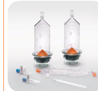
FLEXD-150-SPK Dual syringe kit with 60" low pressure T-tubing with prime tube + 2 fill spikes 20 per box